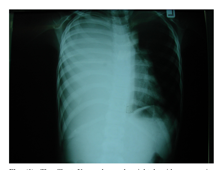
Fig. (1). The Chest X-ray shows the right hemithorax opacity shifting the mediastinum toward the left.

days before admission. He had chest pain, and mild respiratory distress and four years with non productive cough. He was sent to our center due to suspicious diagnosis of ruptured giant pulmonary hydatid cysts confirmed by 5 ml hydatid fluid thoracentesis. Chest roentgenogram, demonstrated a mass density of right hemithorax supposed to be massive pleural effusion with mediastinal shifting to the left (Fig. 1). On admission, the patient status included the mild respiratory distress (i.e., RR=29, PR=80, T=37. 5), and