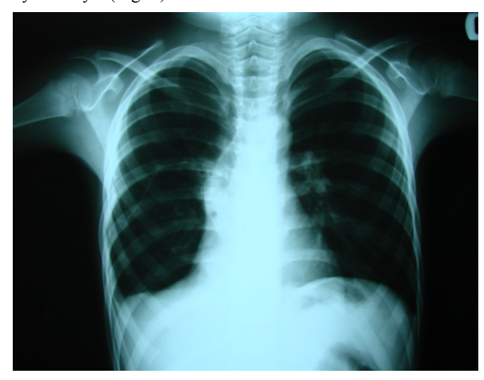
Fig. (3). Controlled chest X-ray is normal.

chest X-ray was normal (Fig. 3). He was in good condition during the six months follow up period while medically treated by Albendazole 800 mg/day. Moreover, pathologic examinations have confirmed the existence of a pulmonary hydatid cyst (Fig. 4).