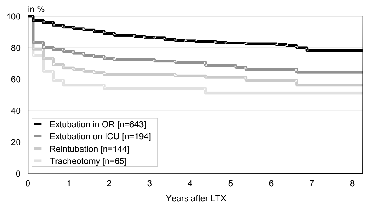
Fig. (1). Patient survival after LTX.

ter. This approach was associated to be safe for the recipient, without any increased incidence for reintubation [13, 14, 23], and is applicable for both the pediatric liver transplantation as well as the living-related liver donation [12, 16, 24]. Further advantage is the reduction in the costs due to the decreased utilization of intensive capacities, which are noted in an American study to be approximately 13% of the total costs of a liver transplantation [25].