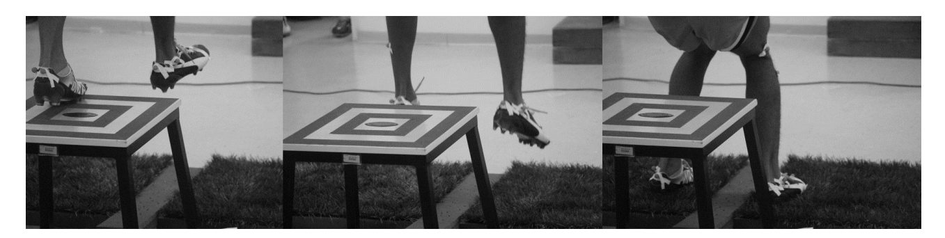
Fig. (1). Drop jump with a height of 40 cm on two boxes with artificial turf 2-Star<sup>®</sup>.

placed on top of two force plates (AMTI BP600900; Watertown, EUA). All DJ's were recorded by five cameras (VICON MX3+; Oxford, UK) in order to obtain 3D joints' analysis.