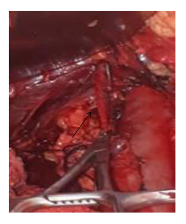
Fig. (3). Inferior vena cava injury site (arrows).