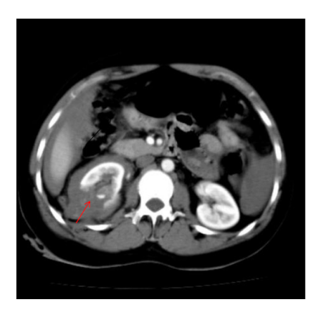
Fig. (1). Contrast enhanced Ct of the abdomen reveals grade 4 renal injury with perirenal hematoma (arrows).

A 24-year old man was the victim of a large knife stab wound sustained five hours before the arrival of the hospital. On admission, the patient was in hypovolemic shock. Physical examination was carried out in which blood pressure of 85\40 mmHg despite intravenous (IV) resuscitation, and distended abdomen with guarding and tenderness were noted. There was a right side wound of entry in the posterior ninth intercostal space lateral to the mid-axillary line. Upon arrival, a urethral catheter was inserted and gross hematuria was detected. Laboratory results reveal hemoglobin of 9.9 mg/dl and hematocrit of 27%. Abdominal Computed Tomography (CT) with contrast revealed Grade IV renal injury with perirenal hematoma Figs. (1 and 2). Urgent laparotomy was performed.