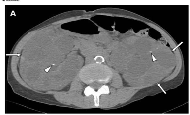
Fig. (1). Axial noncontrast CT scan showing enlarged bilateral kidneys (arrows) with multiple cysts of variable sizes. Some of the cysts have partial rim calcifications (arrowheads).

dominant polycystic Autosomal kidney disease (ADPKD) is the most common hereditary renal cystic disease. Majority of families with ADPKD have an abnormality on chromosome 16 (PKD1 locus) resulting in end stage renal disease at a mean age of 54.3 years. The diagnosis and management of ADPKD relies primarily on imaging studies. Renal ultrasonography is commonly utilized to screen family members for ADPKD [1]. The ultrasonographic criteria for the diagnosis of ADPKD for at risk individuals are age dependent. Individuals aged 40 -59 years with two cysts in each kidney on ultrasonography is associated with a sensitivity and specificity of 90 and 100% respectively. CT scan (Fig. 1) imaging is more sensitive than ultrasonography and can identify cysts with a diameter of 2-3mm.