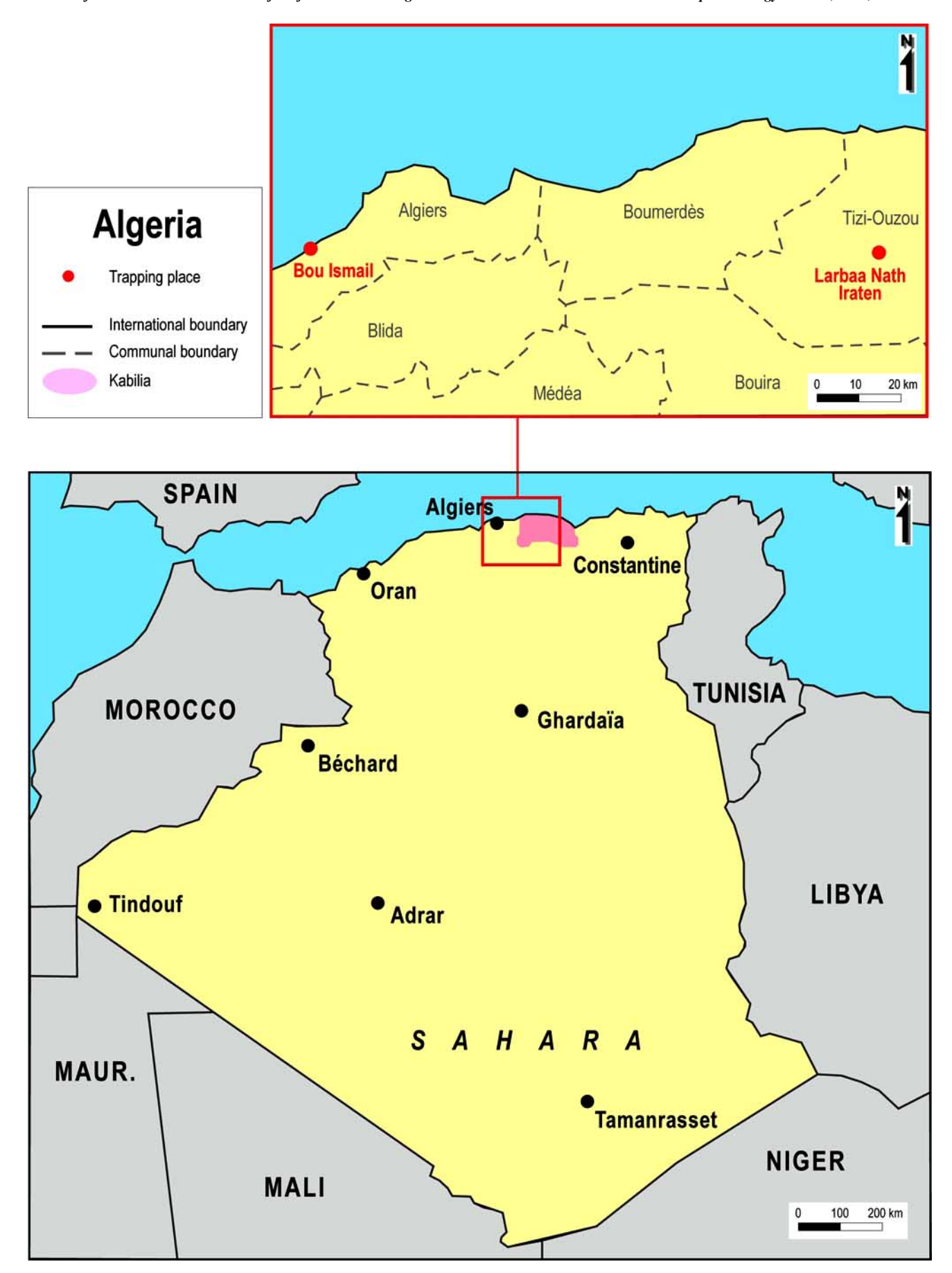
Fig. (1). Geographic Trapping locations in Algeria.